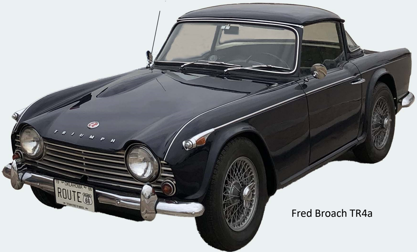
Fred Broach TR4a